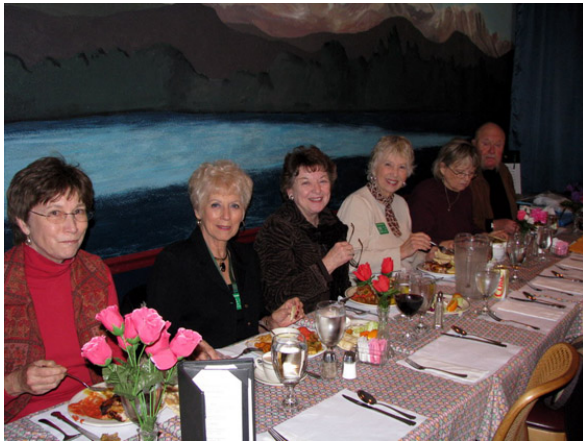
Good food, fellowship, and entertainment at the Kathmandu Kitchen

Thirty-eight members gathered at the Kathmandu Kitchen Restaurant in Auburn and enjoyed a delicious buffet of Nepalese foods. It was so good and enjoyed by all.