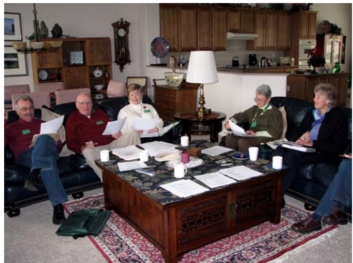
Your board members hard at work!

week. You can see more information on these activities in Pat Ghiglieri's article below. I would like to encourage any new members to do some day hosting if you are not yet ready to home host for a week. Day hosting is a great way to jump in and meet new friends.